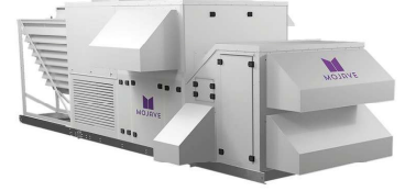
ADB + ERV